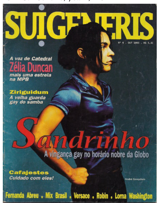
Figure 2- Sui Generis, year I, n.6

When verbal discourses in reports emphasize gay as being "natural" and celebrate the change to a representational model which is similar to heterosexuals, then that same report needs to show that there are other possibilities of representation. The photos used for the edition's main text and front page invest in a dynamic of exploring the boundaries of masculine and feminine representation.