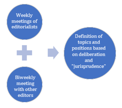
Figure 1 - Process for defining FSP editorial positions

It is important to highlight that, still according to the reports, the editorial director follows the activities of the editorialists closely, talking twice a day with the editor of opinionated section and giving the final endorsement for the texts that will be published.