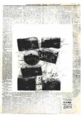
A Gazeta de Noticias on 8/11/1907. Photographic report detached from the text. The artwork influences the pagination and the cutting of the photos.