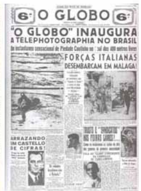
O Globo, 8/17/1934.

During the decades of 1920 and 1930 many press companies in Rio de Janeiro invested in modernizing journalistic language and in newspaper printing plants. News reports are expanded and with the advent of the telegraph, international news arrived almost immediately, enabling its publication in the same day it occured9. But the telegraph only transmits text and the photos were sent via plane, which is not a problem for a weekly magazine. on the other hand, the daily newspapers, committed to reporting the events immediately, received the photos a few days later, creating a time hiatus that made publication of the image senseless. The urge to publish photos together with the report led to investments in photograph transmission technology.