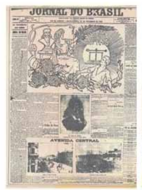
Jornal do Brasil on 11/15/1905. Two photos of Avenida Central and a pen and ink artwork.

beginning of the 20th century is not yet considered modern photojournalism - something that started in the following decades - one cannot affirm it did not aggregate information to the news. Photography adds data that text does not transmit on its own, which confers a new dimension to the news. The visual information, polysemous by nature and interpreted differently by each reader, is also univocal, since the same image will reach everyone. Afterwards, with the emergence of the news agencies and telegraphic transmission, journalistic images would become universal.