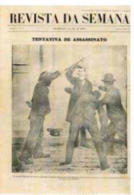
May 20, 1900