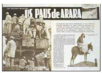
Photo coverage by Mário de Morais and Ubiratan Lemos, First Esso Prize11 - 10/22/1955

In the 1940's and 1950's photojournalism in O Cruzeiro reached its maturity. From the double photo covering two pages and the double page filled with photos of the 1930's to the great reports of the following decades, the journalistic language was perfected, and prepared, in conjunction with shorter texts, to account for the information. A report that occupied six or more pages followed a visual hierarchy where the photo that carried the most newsworthy content opened the coverage, occupying the whole page, followed by smaller ones that completed the information. This report outline seduced the reader and became the role model for the Brazilian press, and was the ideal photo coverage for the weekly magazines.