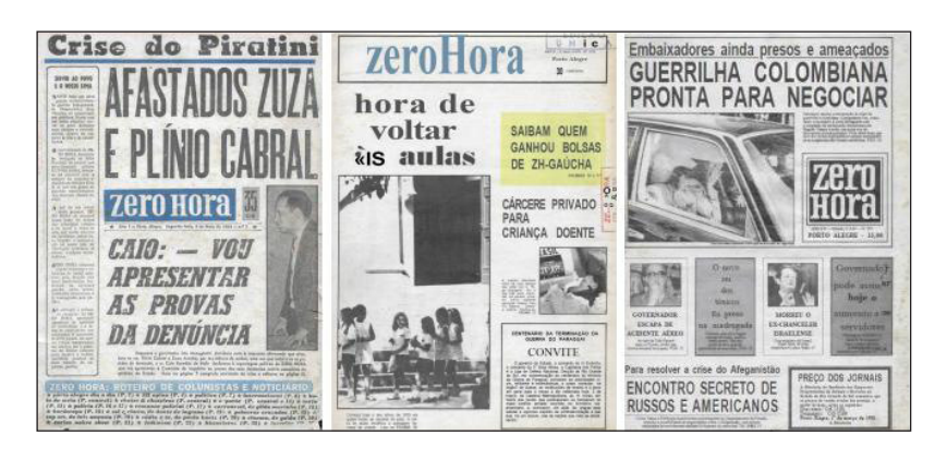
Figure 1: Covers of ZH from May 1, 1964, March 1, 1970 and March 1. 1990

Zero Hora was created in May 1964, during the beginnings of the Brazilian military dictatorship (Figure 1). Today it circulates in the whole state of Rio Grande do Sul (RS) and it is the flagship of eight periodicals owned by the RBS Group – Rede Brasil Sul –, a company with activities in several areas related to information and entertainment. According to the 2009 data of the Instituto Verificador de Circulação (IVC), the circulation of this newspaper was the sixth largest in the country and the largest in Rio Grande do Sul.