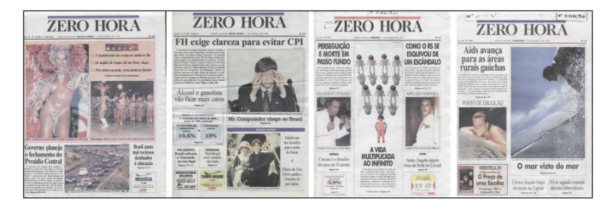
Figure 3: Covers of ZH from March 1, 1995, 1996, 1997 and 1998, respectively

began their first experiments on the web. In this period, the first section to become available on the Internet was the informatics section and in the next year – 1996 – digital Zero Hora was created, updated every 24 hours.