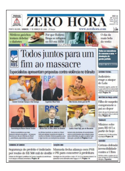
Figure 11: Cover of ZH from 2008

One notices that the main story has, in addition to a lot of pictures, three frames: the lavender box, the thick black cutoff rule enveloping it and ten announcements around it. These elements, used to separate and to highlight the content, could be abolished without any damage to the cover. In addition, there are almost no empty spaces. The excess of elements makes it harder to read the cover quickly and attributes to the page a low pregnancy due to its opposition to the concept of visual simplicity.