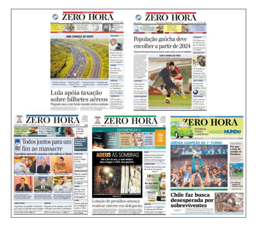
Figure 9: Covers of ZH from March 1, 2006, 2007, 2008, 2009 and 2010, respectively

The design of the first page of the issues from 2006 to 2010 (Figure 9) was identified as the innovation period – diverse strategies of visual attraction, which embraces several meaningful changes. A graphic recasting in September 2005 drew much more attention to the sections' announcements on the cover, creating a horizontal cutoff rule of headlines under the logo. The design began to favor more open pictures, and on the horizontal cutoff rule there are always at least two images. The recasting standardized the size and the font of the headlines in the right column, which also received a thin black cutoff rule. The standing heads now have a lavender background and a thick blue cutoff rule above them. The same color is also used on boxes and other elements of the page.