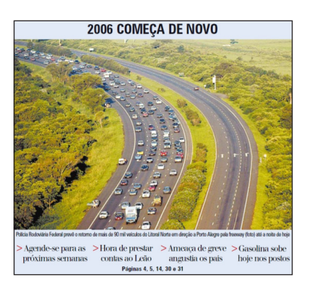
Figure 13: Box on the cover on March 1, 2006

Another example of how the design might damage the readability is the box on the cover from the year 2006 (Figure 13), which deals with several stories regarding the end of the summer school vacation. The highlighting of four smaller headlines is made with a red arrow next to each text. Since arrows are symbols used to indicate direction or sense, they create a certain notion of movement in the lines of the title, allowing the assumption that one block follows the other. However, the subjects are not linked in a continuous way, neither regarding the structure - because they are not in consecutive pages - nor regarding the theme - because they are in different sections.