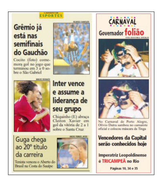
Figure 10: Box used on the covers of 2004 and 2001, respectively

three relevant sports news items. The three pictures in the box end up competing with each other and not highlighting any one of the three events. There is even an attempt to compensate for the size difference among them by using a darker shade of yellow and a black cutoff rule on the background of the last picture that ends up polluting even more the small area that has already been divided into two columns. Another box model that attracts the attention of the reader for the wrong reasons is the one used on the cover from 2001 (Figure 10). The cutoff rule, the background, the border and the picture create an excess of information that is completely unnecessary in such a reduced space.