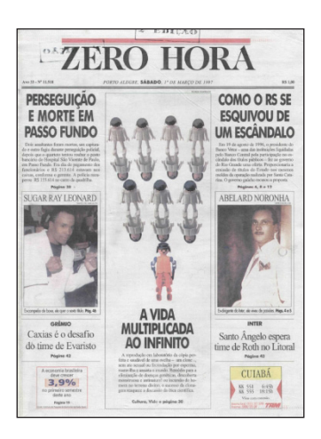
Figure 12: Cover of ZH from March 1, 1997