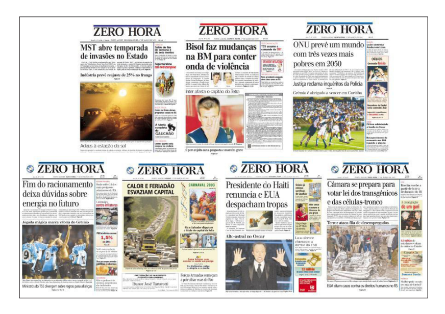
Figure 6: Covers of ZH from March 1, 1999, 2000, 2001, 2002, 2003, 2004 and 2005, respectively

The horizontal logo was consolidated during this period, but not before going through a slight recast that was not kept. We can notice on the covers from 1999 and 2000 that there was a change of font in the logo. In these two years (Figure 7), the logo is seen with a type in which the serif is more prominent and with its extremities in a more squared shape form than what was used until then and on the issues published after 2001 (Figure 8). From 2002 onwards, beside the logo, there is the constant presence of RBS's logo, close to the name of the newspaper on its left side.