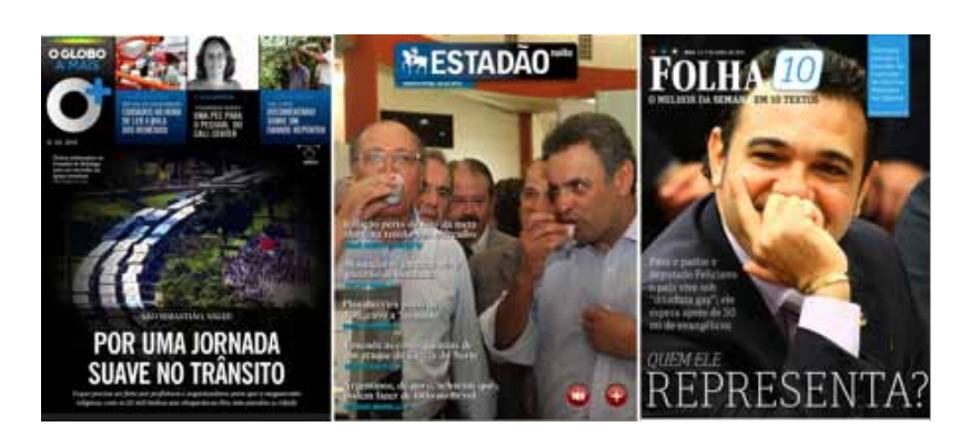
Figure 1 Covers of autochthonous apps: O Globo a Mais, Estadão Noite and Folha10

Journalistic convergence and mobile device journalism embody new dynamics for production processes and new consumption. Westlund (2013) argues for the need to think of a "new journalism model" in view of the culture of mobility established with tablets and smartphone devices and touch screen properties. These last which highlight a new category: tactility, (PALACIOS, CUNHA, 2012) as one of the prominent characteristics for mobile device journalism<sup>2</sup>. These specific characteristics are also explored in a further text (BARBOSA, SILVA, NOGUEIRA, 2012) addressing the idea of autochthonous products (Figure 1), defined as applications of an original nature, which are inserted within the modality of investigating resources characteristic of mobile platforms, in terms of navigation, touch interaction and other app particularities.