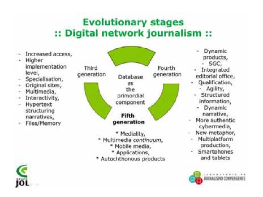
Table 1 Characterisation of the evolutionary stages of digital network journalism