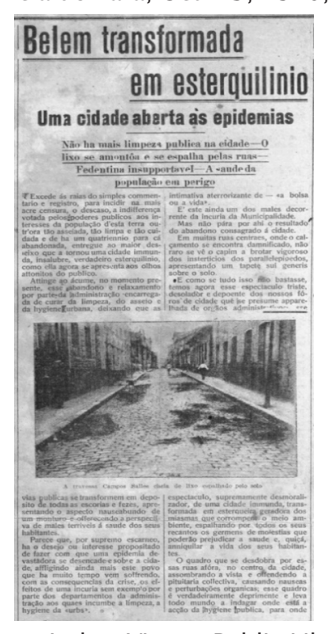
Figure 6 - One of the streets of Belém in the 1920s. Província do Pará, Oct. 15, 1920, p. 1

The cleanliness of the city (Figure 6) and social issues about the capital of Para were a few worrisome issues for A Provincia in the 1920s. These preoccupations materialized in pictures showing holes in the streets, garbage and the state of the sewage system (A PROVÍNCIA DO PARÁ, Oct. 15 1920, p. 1; Oct. 22 1920, p. 1).