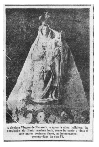
Figure 4 – Image of the Virgin of Nazareth. Folha do Norte, Oct. 10, 1920, p. 1