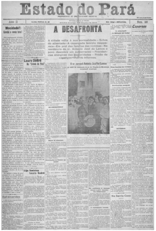
Figure 1 - One of the first Pará newspaper photographs. Estado do Pará, Sep. 01, 1912, p. 01.