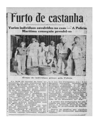
Figure 10 – The nut theft case. Folha Vespertina, Apr. 13, 1940, p. 4