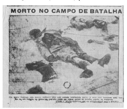
Figure 7 – Soldier killed in combat. Folha Vespertina, Jan. 22, 1940, p. 1