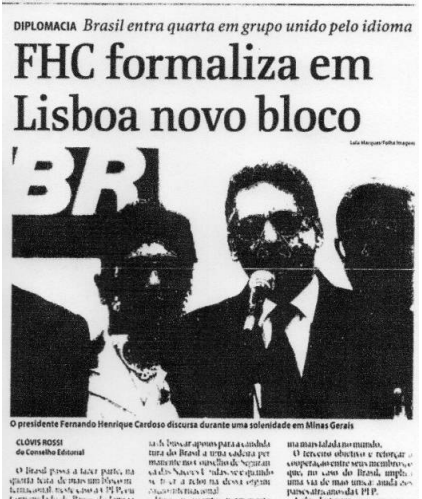
Figure 1 – News report from Folha de S.Paulo E S.PAULO