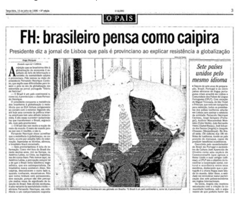
Figure 2 – News report from O Globo